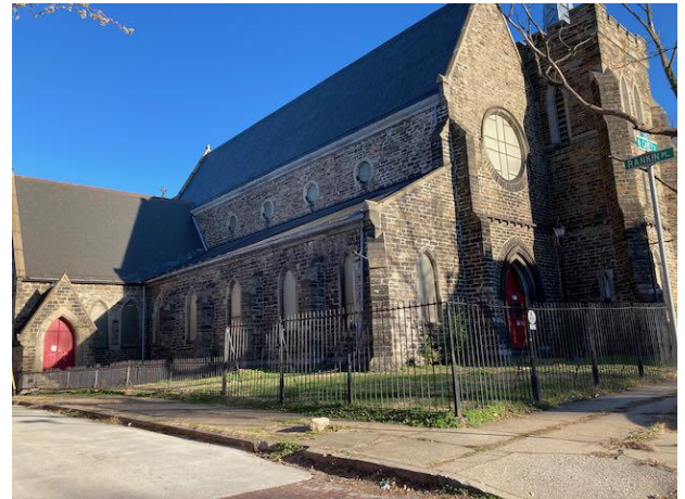
Northwest corner of St. Luke's Church showing yard with proposed location of rain garden.

Summary: St. Luke's Youth Center (SLYC), is soliciting proposals for construction-ready designs and permits for improvements to stormwater management infrastructure on the campus of SLYC in west Baltimore. The project will have two phases; (1) to address an immediate need to manage water infiltration into the basement, especially at the northwest corner of the church: evaluate and design improvements to all of the church gutters and downspouts; evaluate and design improvements to foundation drainage on the north and west side of the church; and design a rain garden to capture stormwater, and (2) design stormwater management improvements for the rest of the campus. Phase 1 will be completed as soon as possible to enable implementation to move forward quickly. Phase 2 will proceed with input from SLYC, the community and other funders to incorporate stormwater BMPs into a comprehensive plan for improving the play field and parking lot.